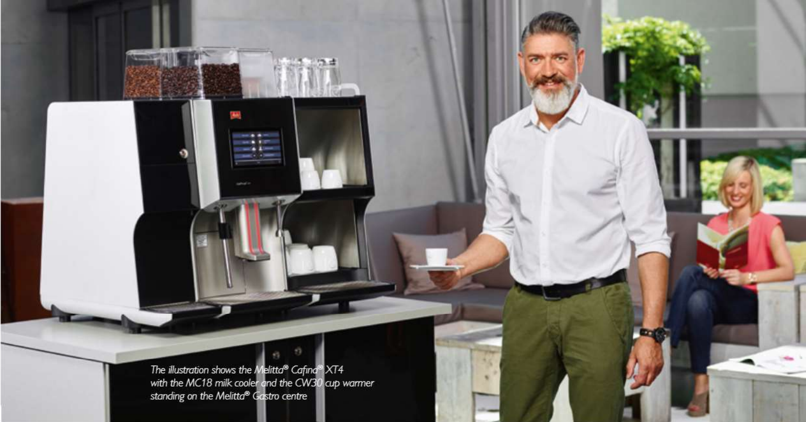
The illustration shows the Melitta® Cafina® XT4 with the MC18 milk cooler and the CW30 cup warmer standing on the Melitta® Gastro centre